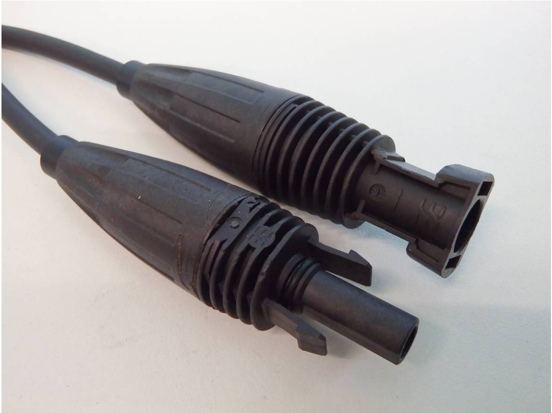
PV-Stick from Weidmuler