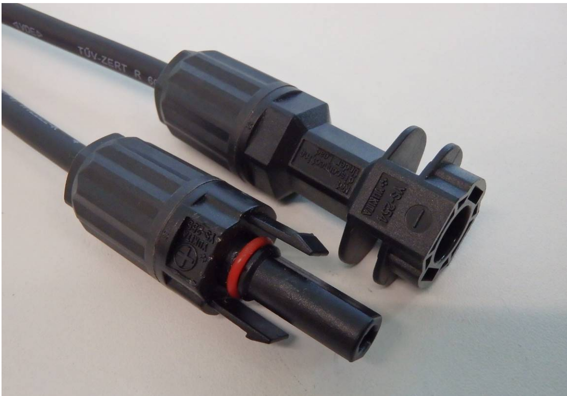
Yukita YS 254/255 from Sunpower