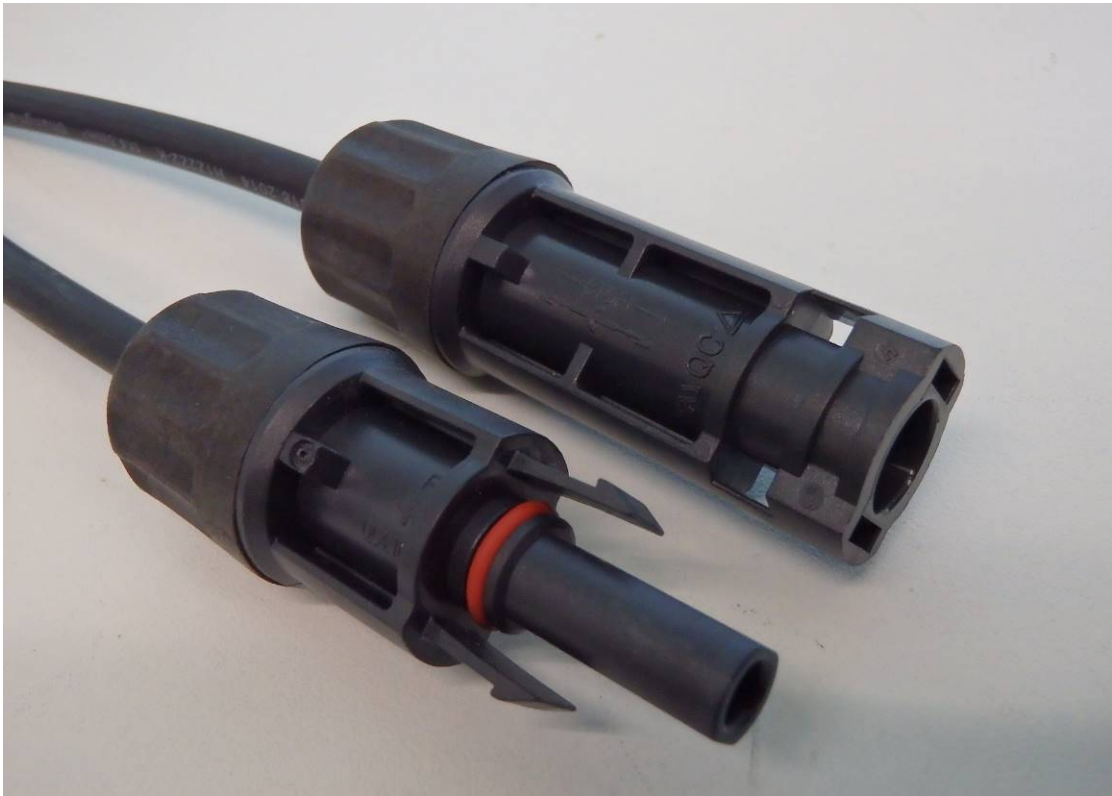
QC4 from JA