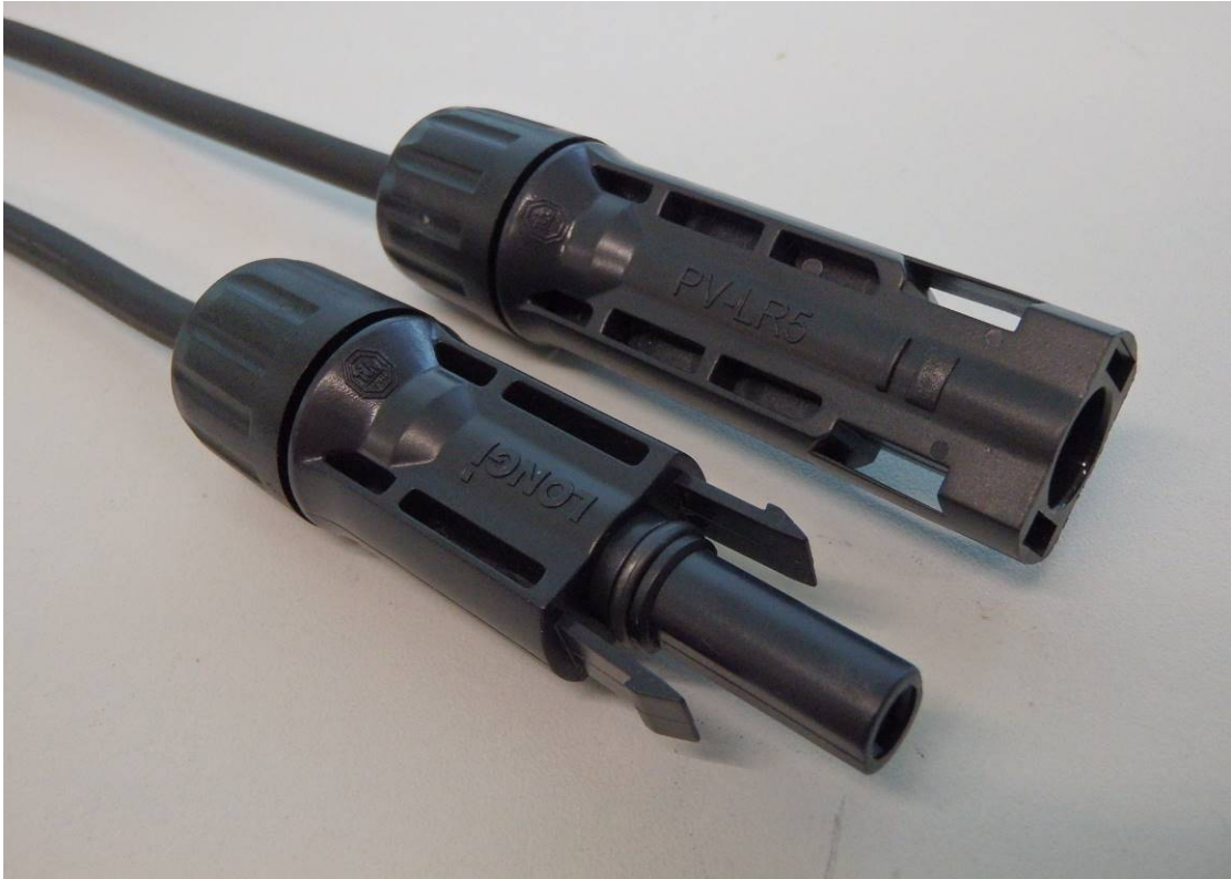
PV-LR5 from Longi