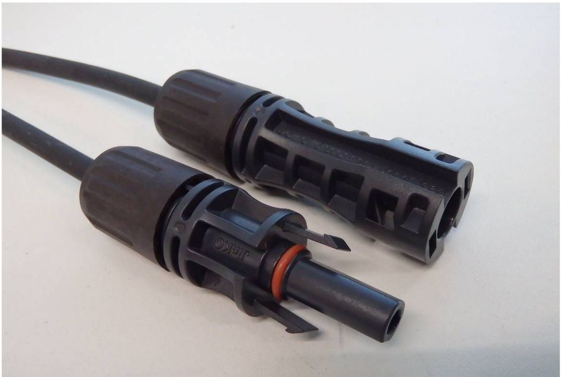
JK03M from Jinko