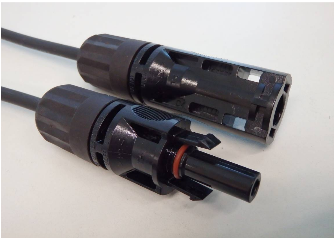
T4-PC from Canadian Solar