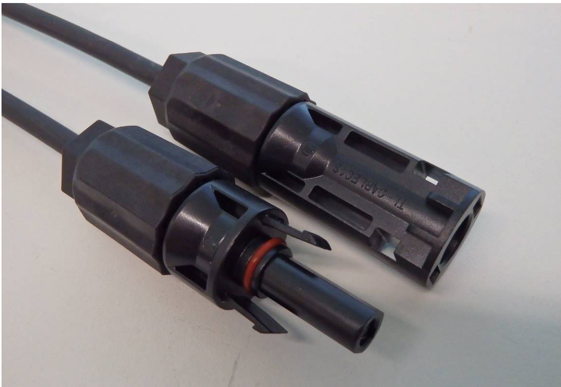
C4 from Suntech