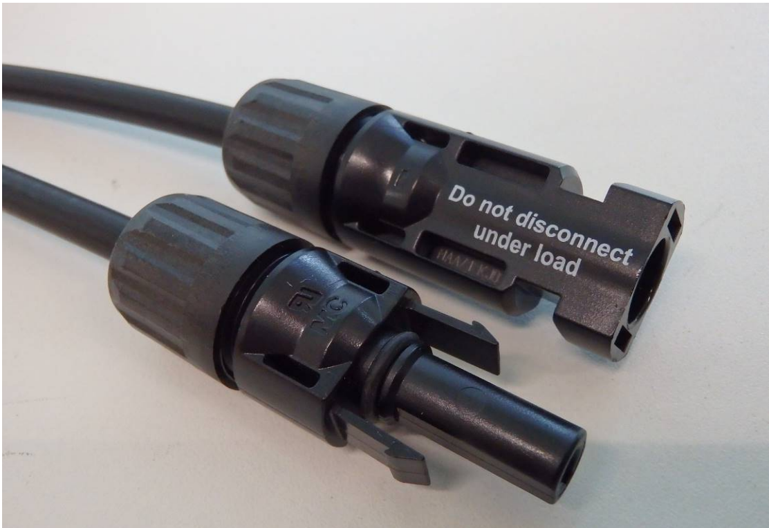
MC4 from Stäubli