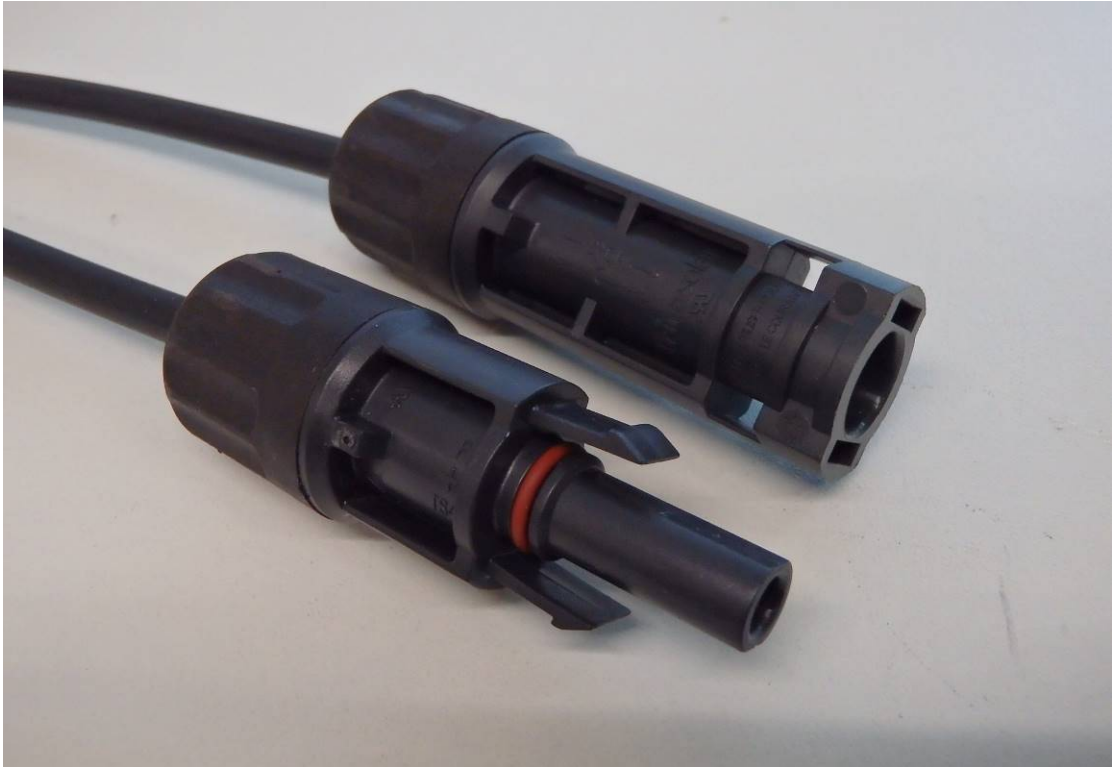
TS4 from Trina